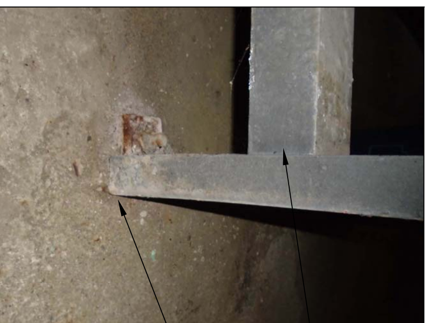
TYPICAL PIPE RACK FRAME DETAIL

REPLACE WITH AN ANGLE PER DETAIL F OR CHANNEL PER DETAIL E REPLACE BOTTOM OF CHANNEL AND BASE PLATE PER DETAIL A