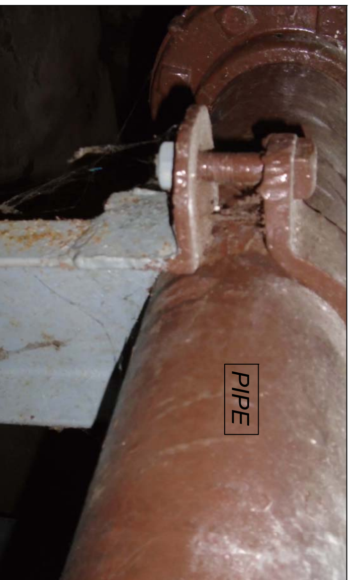
PIPE CLAMP FLOOR SUPPORT STAND DETAIL REPLACE IN KIND - FLOOR ATTACHMENT AND PIPE CLAMP OR REPLACE BOTTOM OF CHANNEL AND BASE PLATE ONLY (SEE DETAIL A)